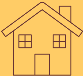
Average Home Value