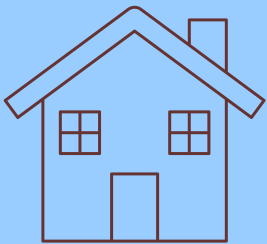
Average Home Value