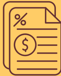
Monthly Homeowner Tax Bill Increase