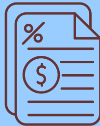
Monthly Homeowner Tax Bill Increase